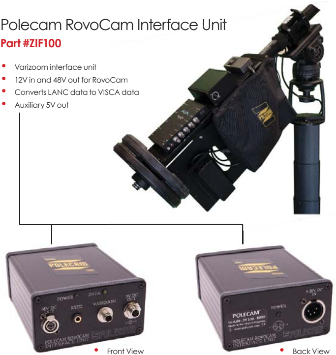
• Front View