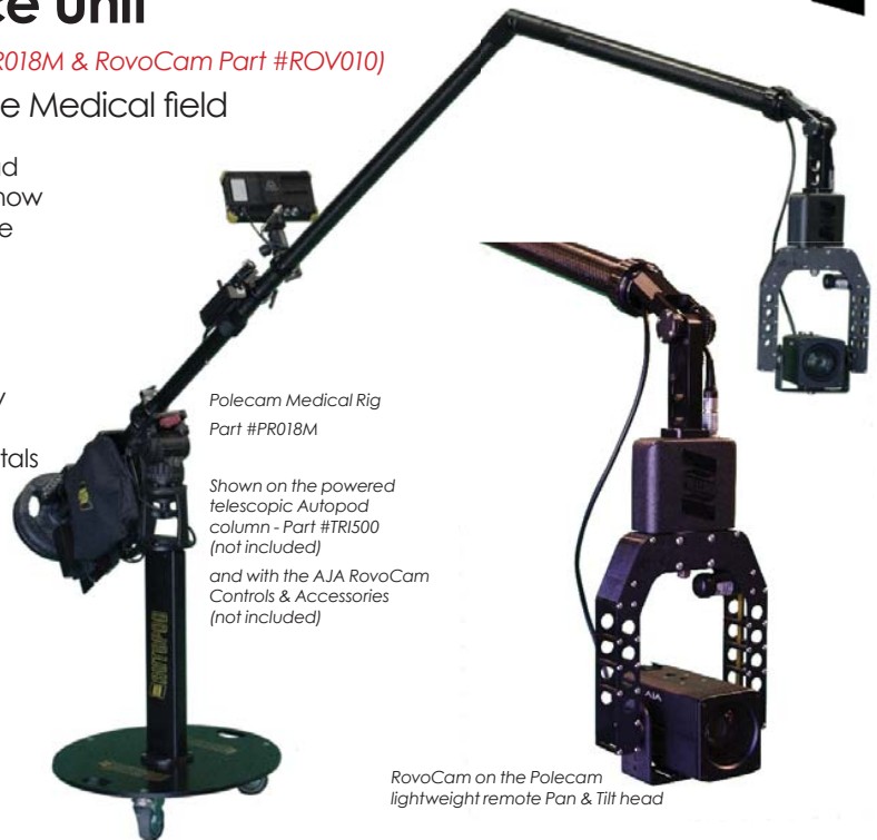
Polecam Medical Rig Part #PR018M

The most common observations from surgeons that have worked with Polecam is how unobtrusive and flexible it is, the quality of the footage, and most importantly how the filming does not interrupt their work compared to having a cameraman alongside. An overhead camera cannot film through a surgeons head!